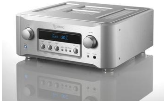
We also listened to the comparison with the F - 05

It is true that it is large, but the heat generation is likely to be considered standard as AB class, so it seems no problem to insert it into the rack and use it.