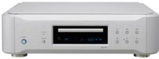
SACD / CD player "K-07X"

The thickness of the orchestra's bass and the pizzicato of the contrabass, the momentum and dynamism are properly presented/transmitted. Low end is the one which yields half a step to F - 05, but the clarity of the higher registers are still accurately transmitted. This is especially felt when listening the the female jazz vocals, where the beautiful expression can be richly felt.