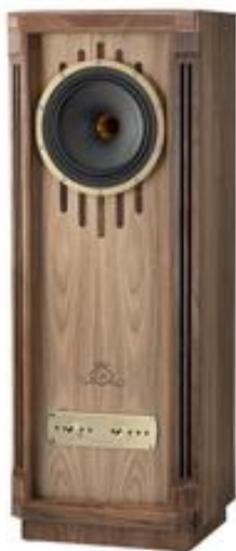
TANNOY "Kensington / GR"

It also has a powerful headphone output compatible with a wide range of impedance. In addition, the main machine has an option board slot, which can accommodate this DSD to DA converter board (80,000 yen before tax). PCM, coaxial and light up to 192 kHz / 24 bits, USB B terminal is PCM 384 kHz / 32 bit and DSD 11.2 MHz, also can be used for high res conversion.